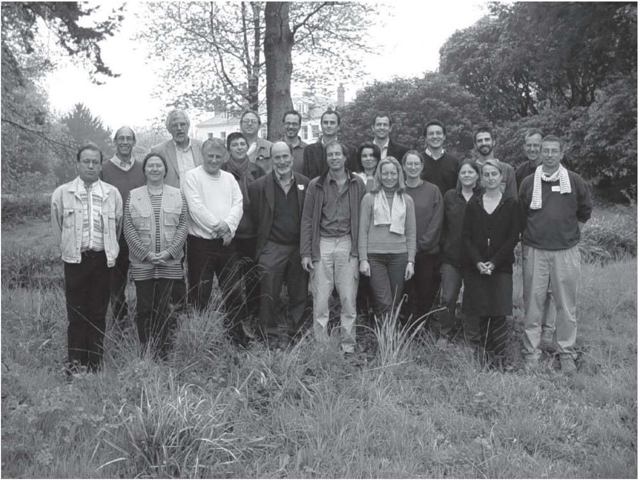
Participants of the workshop held April 29 – 30, 2004